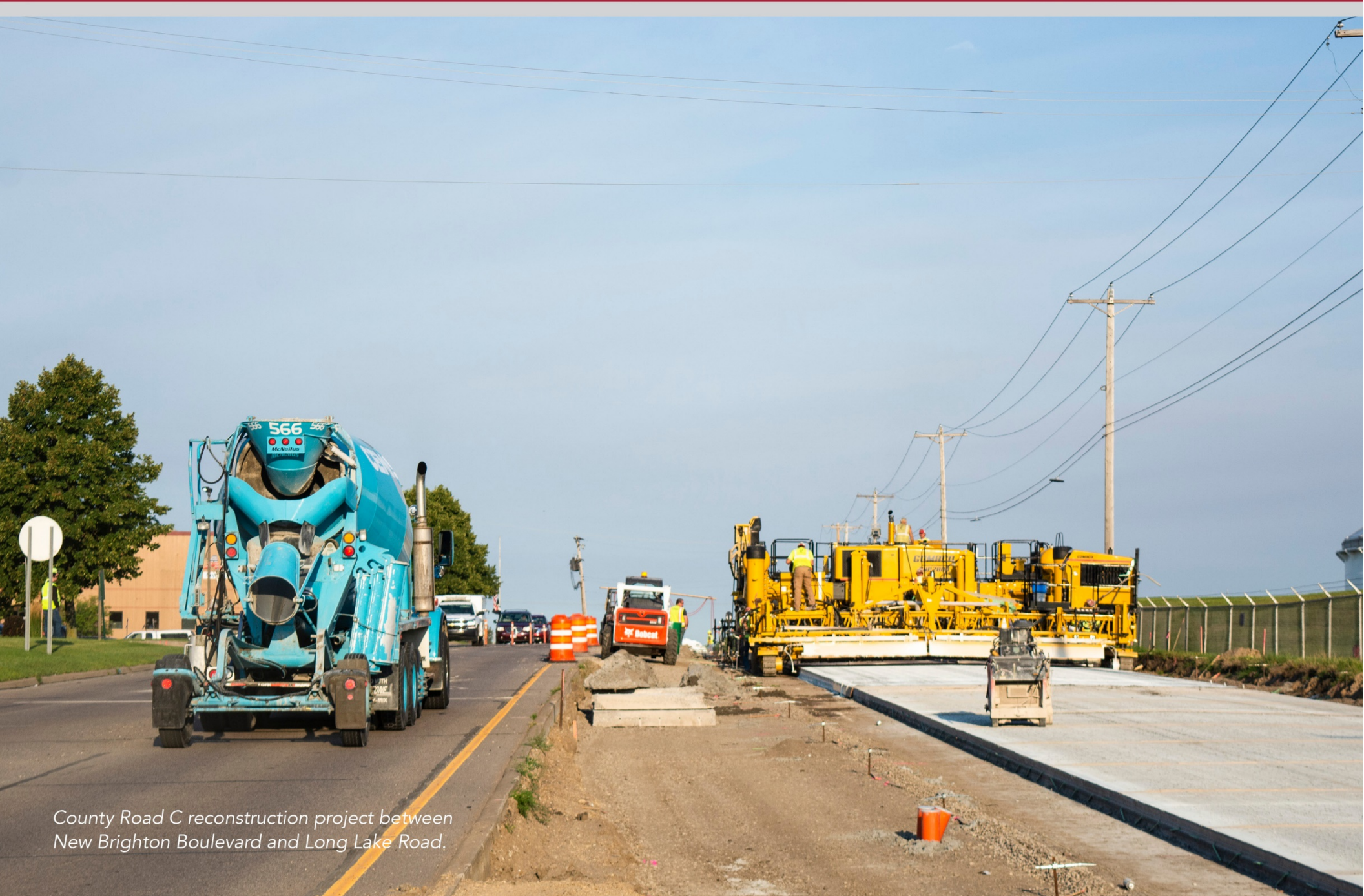
County Road C reconstruction project between New Brighton Boulevard and Long Lake Road.