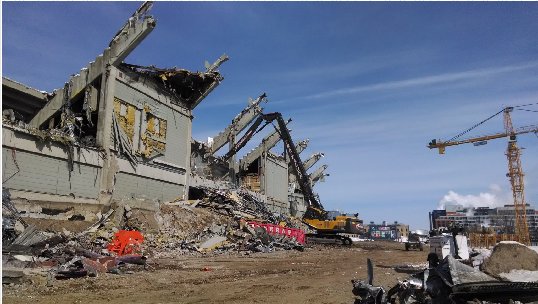
MetroDome Demolition with new Volvo EC480D High Reach Demolition Excavator