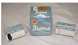
Savon pour L'acné Diana soap – 31 ppm (left box) Savon pour L'acné Diana soap – 4.08 ppm (right box)