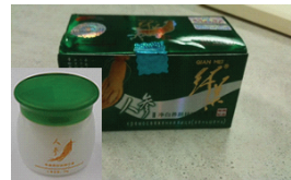
Qian Mei – white cream 4,650 ppm