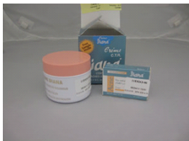
Crème Diana C.T.R. 4,180 ppm (jar on left)