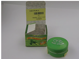
“Lemon Herbal Whitening Cream” 33,000 ppm