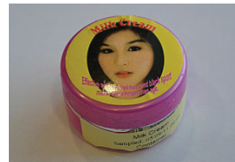
Milk Cream 4,600 p ppm