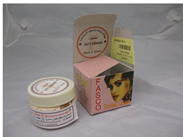
Fasco 4,600 ppm