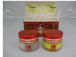
Lulanjina – yellow cream 16,700 ppm (jar on right)