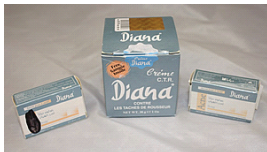
Crème Diana C.T.R. – 6,370 ppm (middle box)