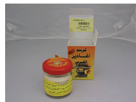
Cream Aghader 135 ppm