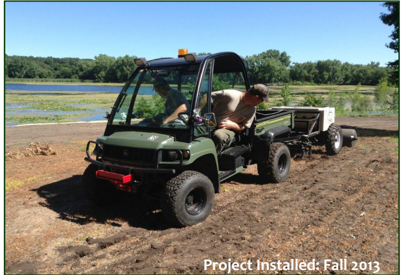
Project Installed: Fall 2013