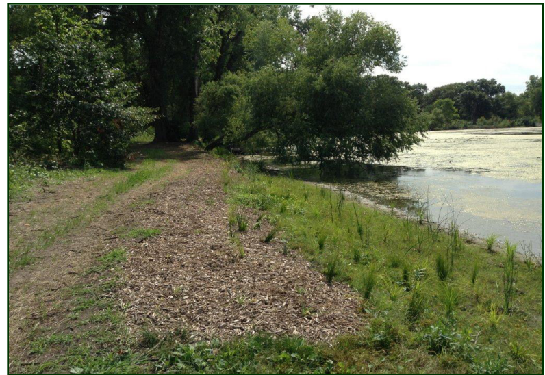
Ramsey-Washington Metro Watershed District

Funding for this project was provided by a grant received by the Ramsey Conservation District (RCD) offered by MN Board of Water and Soil Resources (BWSR) through funding provided by the Clean Water Fund, the RWMWD, and the property owner.