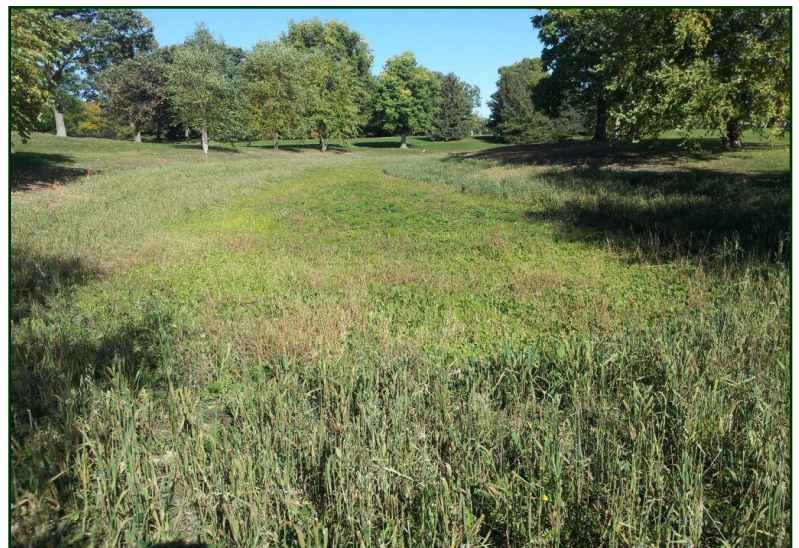
Ramsey-Washington Metro Watershed District