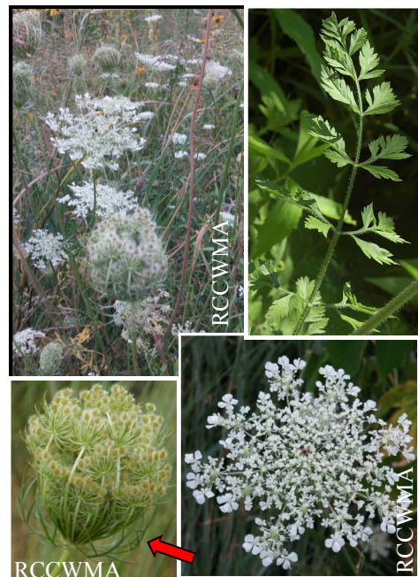
Queen Ann's Lace/Wild Carrot