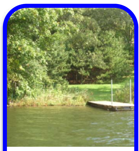
Hanna Res: Sept 2007 66 lineal feet/ 960square feet $5,385.00 Project Cost

Pordello Res: June 2008 45 lineal feet/ 405square feet $2,550.00 Project Cost