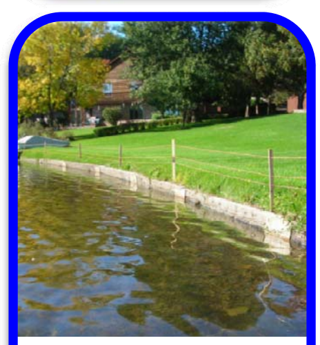
Lundell Res: Oct 2007 112 lineal feet/1,120 square feet $6,625.00 Project Cost