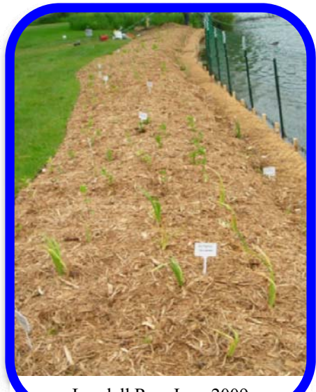
Lundell Res: June 2009