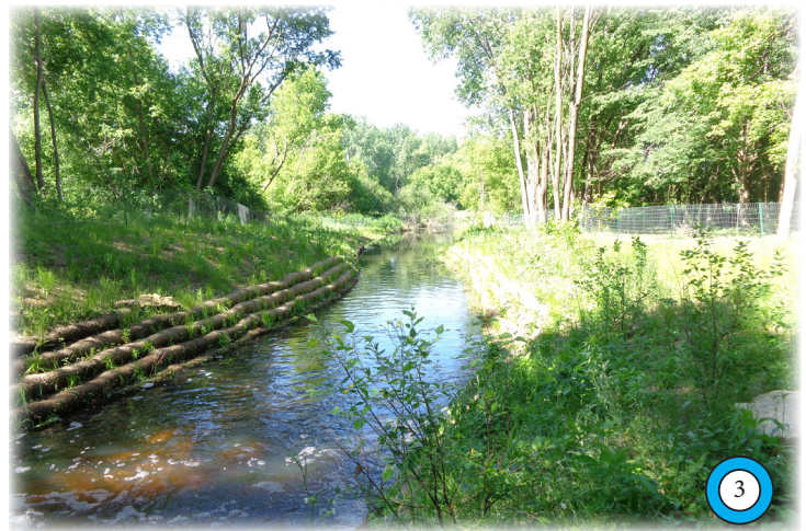
LAMBERT CREEK- Native planting and shoreline stabilization

We will be picking up individuals at the Ramsey County Court House at 10 am and at the Keller Golf Course at 10:10 am. Our tour will leave the Keller Golf Course at 10:15 am. The last stop of the tour will be at Keller Golf Course where we will tour the native restorations and then lunch will be provided in the newly renovated Keller Club House from 12 P.M. to 1 P.M. We hope to see you there!