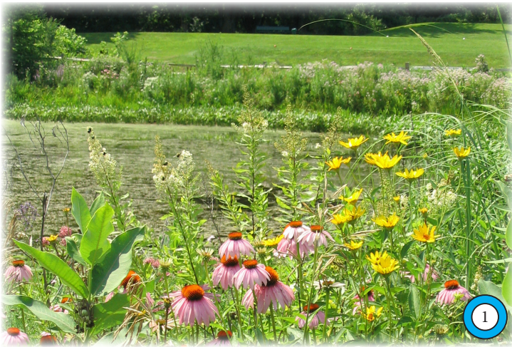
KELLER GOLF COURSE- Native Planting and shoreline stabilization