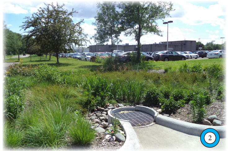
LAKEVIEW LUTHERAN CHURCH- Parking lot raingardens